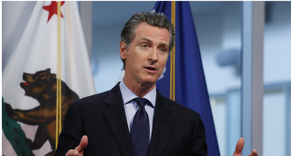
Gavin Newsom, Governor of California

"Governor Newsom's 2021-2022 budget proposal reflects what we are all hoping: that things